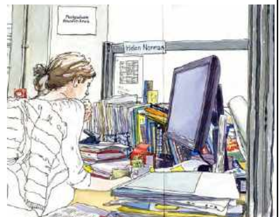
Morgan Centre residency: open-plan research area