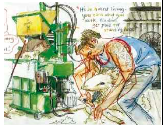
Western Australia residency: sheep shearer