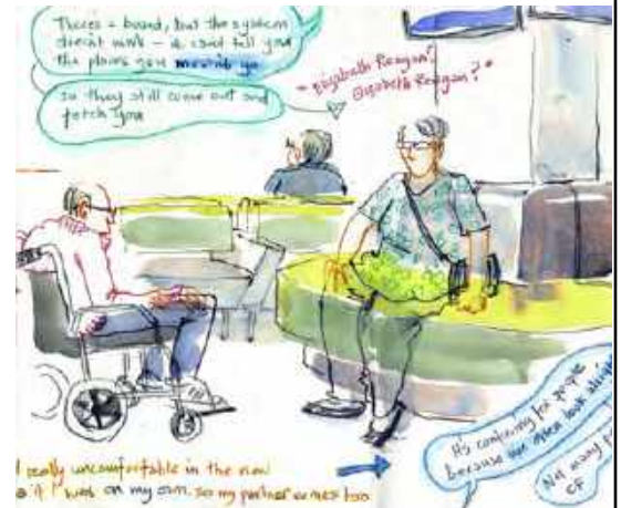
Cystic Fibrosis residency: hospital waiting