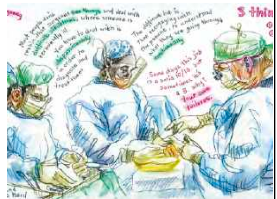
Western Australia residency: hand surgeon