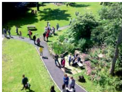
Summer audience in the merlin gardens

During this trial period the Merlin has hosted (with the friends of Edward Carpenter) the northern premiere of a play highlighting the struggles and triumphs of lesbian and gay asylum seekers.