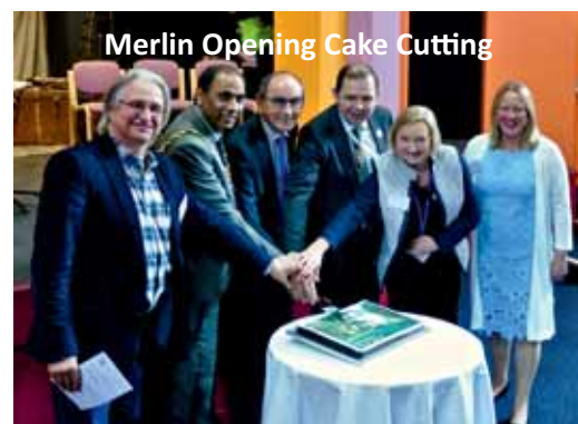
Merlin Opening Cake Cutting