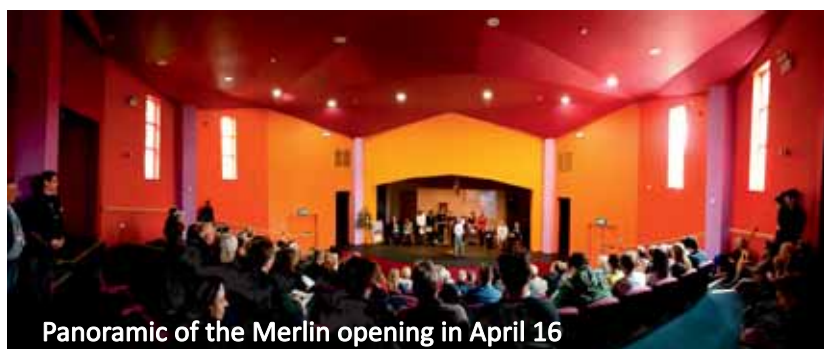
Panoramic of the Merlin opening in April 16

The spring and summers activity follows on from the reopening of the theatre last year. Due to flood damage the Merlin has been out of action for 5 years, but thanks to £1m successful fundraising was completely renovated. The building renovation was completed last autumn and the theatre immediately started being used by the students of Freeman College and Brentwood Specialist School for their music and drama work. The Merlin is managed and run by Freeman College which along with Brantwood Specialist School are national centres of excellence in providing education and support to children and young people with autism and a wide range of behavioural, emotional and mental challenges. The School and College are run by Ruskin Mill Trust, a national educational charity with an international reputation for pioneering care for young people with special needs.